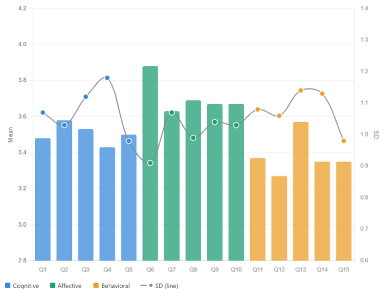
Figure 3. Mean and SD of individual items of the Scale

Positive attitude toward IKS leads the entire dataset at M = 3.88 with the lowest SD (0.91), meaning respondents not only scored highest here but also agreed most consistently. Q8 (Emotional connection, 3.69), Q9 (Valuing IKS in daily life, 3.67), and Q10 (Respect for IKS holders, 3.67) round out the top group among all Affective items. Frequency of IKS use (M = 3.27) is the weakest item overall, followed closely by Q14 (Integrating IKS in practice, 3.35) and Q15 (Advocating for IKS adoption, 3.35). This confirms the attitude-behavior gap: participants demonstrated favourable attitudes toward IKS but the actual frequency and depth of practice is noticeably lower. Items with high SD ( \geq 1.10 ) are Q4 (Familiarity with IKS sources, 1.18), Q13 (Sharing IKS with others, 1.14), Q14 (Integrating IKS, 1.13), and Q3 (Understanding IKS value,